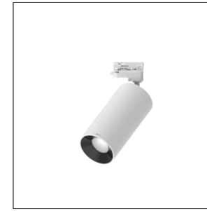
eSpy in-body driver system