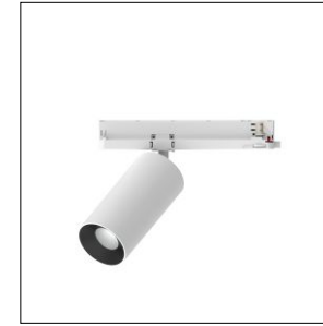
eSpy in-track driver system (380v track system only)